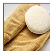
Free applicator and buffing cloth

possible. Independent tests against leading and well-known brands confirm our own test results proving that Auto-balm is the most protective wax or polish for your car.