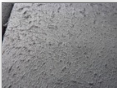
Alcantara with pilling. Use the Sanding Pad.

Alcantara is prone to pilling. Abrasion causes the fibres to develop into small spherical nodules. If the surface is not too damaged, it can be restored with the COLOURLOCK Sanding Pad (see video). In case the material is too damaged, it has to be replaced.