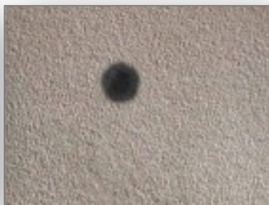
Burn hole of a cigarette. Cannot be repaired.